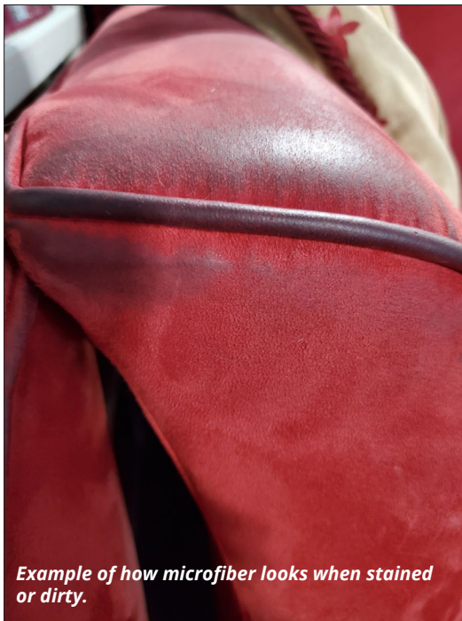
Example of how microfiber looks when stained or dirty.

By 2023, the once trendy microfiber sofas of a Quebec homeowner had seen better days and been relegated to the basement for use by his children and their friends. He wanted to remove the dark stains left behind after years of use but, since he had cats, the owner didn't like the idea of using rubbing alcohol like the Internet suggested. One day, he decided to try some HYGIEA2400™ on a test area to see how it worked. He sprayed a 20X dilution on the spot, let it sit for a minute, and rubbed the area with a damp cloth. Since microfiber looks dark when it is wet, he couldn't tell how it had