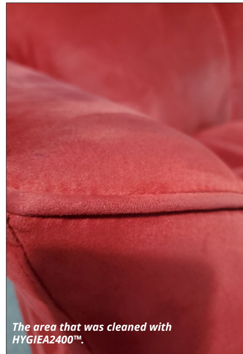
The area that was cleaned with HYGIEA2400™.

worked until he had let it dry overnight. When he checked it the next morning, the stained area looked remarkably clean like new microfiber! Log in to read the full case history: https://www.bionetix-international.com/resources/case-histories/