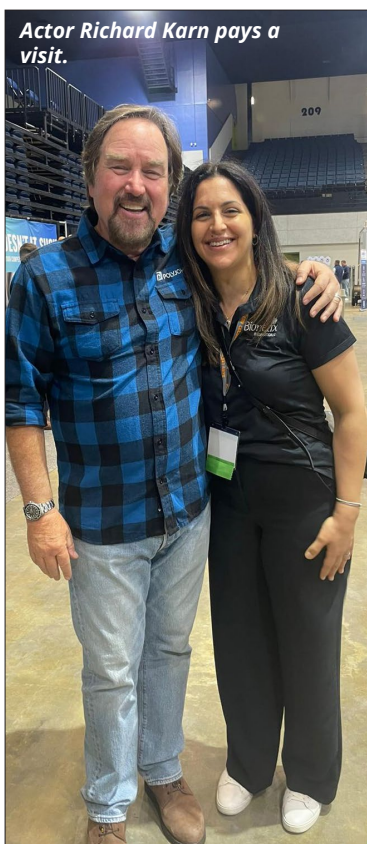
Actor Richard Karn pays a visit.