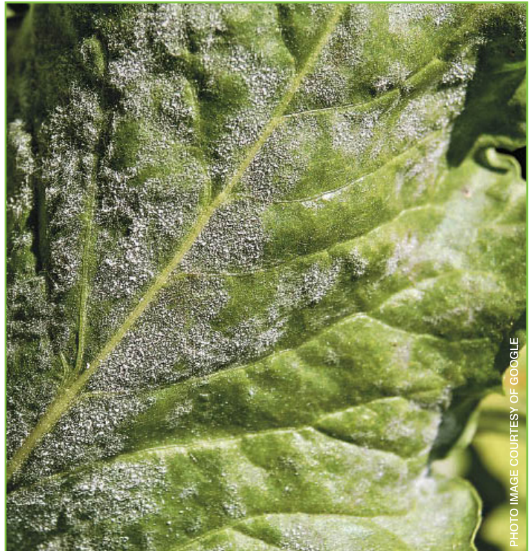
Sugar beet leaves with fungal disease called powdery mildew

Organic Plus SP Soil Amendment helps control the zoospores that can attack everything from beets and carrots to strawberry plant leaves. Organic Plus SP also boosts soil fertility and crop yield while helping to deactivate toxic chemicals and chelate fertilizers. The high concentrations of humic and fulvic acids, rhamnolipids, marine plants, and micronutrients in Organic Plus SP work together to stimulate healthy microbial activity in the soil, increasing plant nutrient uptake while suppressing various harmful microbes. It can be used as a seed soak or fogged on plants as they develop. Another option is adding Organic Plus SP to nutrient solutions in hydroponic operations, which are especially prone to fungal infection.