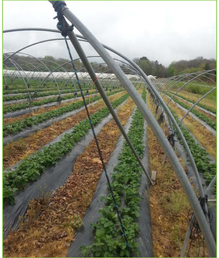
Organic Plus SP solutions on strawberry farm

Organic Plus SP has been approved for organic agriculture by Quebec Vrai (OCQV), an organic certification organization in Canada. All-natural components of Organic Plus SP make it an attractive replacement for traditional chemicals used to control disease and stimulate growth. By harnessing the natural strength of Organic Plus SP, it is possible to boost crop health and decrease losses in a more ecologically friendly way.